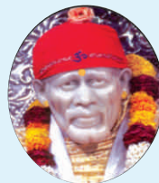
Shirdi 22 Kms from Loni