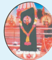
Shani Shingapur 60 Kms from Loni