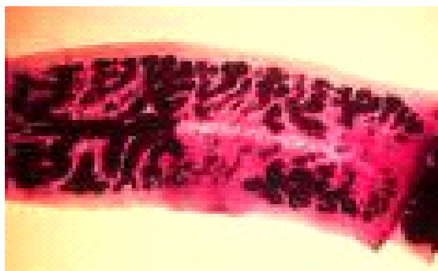
Fig 1: Showing proglottids

and do not elicit inflammation. When the larvae die, they induce a vigorous granulomatous inflammatory response that may produce symptoms depending upon anatomic location. [3] Although most reported cases of cysticercosis involve the brain, this report describes a case of rapid onset lump in abdomen due to Taenia solium during puerperium.