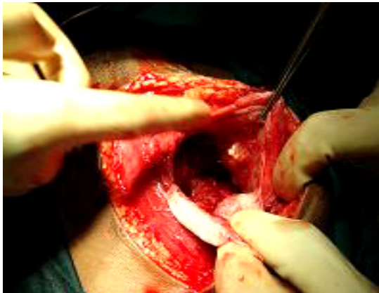
Fig 4: Showing cyst with daughter cysts

revealed cysticercosis of rectus abdominis muscle (Fig. 5). She was treated with tab. Albendazole (400 mg ) daily for 21 days. Her x ray skull (Lateral view) and ophthalmic examination were done to rule out evidence of cysticercosis. She was discharged on 11 th post operative day.