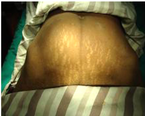
Fig. 2 Showing abdominal lump

She again got admitted after 2 days (on 17 th postnatal day) with complaints of pain in abdomen and lump in lower abdomen since 24 hours. Examination revealed marked tenderness in both the iliac fossa. A 12 x 5 cm cystic mass felt in right iliac fossa. Uterus could not be felt separately from the mass. A similar mass of about 9 x 5 cm cystic in nature felt in left iliac fossa (Fig. 2). On per vaginal examination, there was fullness in pouch of douglas and soft boggy mass was felt in posterior fornix. A provisional diagnosis of ovarian cyst was made.