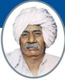
Padmashri Dr. Vitthalrao Vikhe Patil (1901-1980)