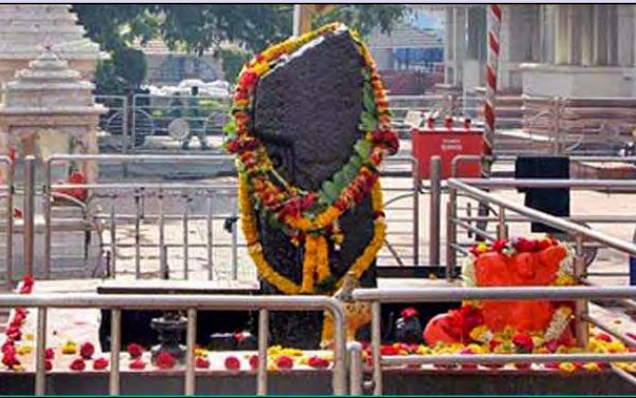
Shani Shingnapur - Shanidev