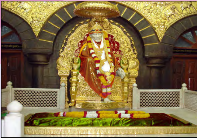
Shirdi - Sai Samadhi