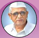
Padmabhushan Dr. Balasaheb Vikhe Patil