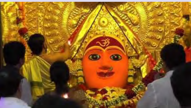
Sonai - Renukamata Mandir