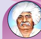
Padmashri Dr. Vithalrao Vikhe Patil