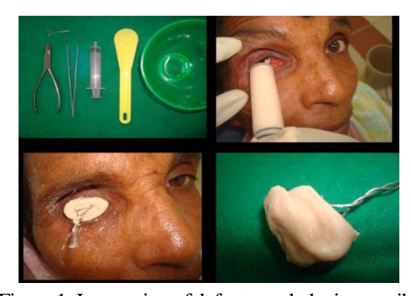
Figure 1: Impression of defect sought by irreversible hydrocolloid impression material.

Impression and wax pattern fabrication-The impression of the anophthalmic eye socket was sought by introducing an impression material into the eye socket using a disposable syringe and projecting it out between the lids. The impression material used here was irreversible hydrocolloid (ALGINATE). After the impression material was set, the impression was removed and invested in dental gypsum in order to obtain a positive cast of the eye socket. Subsequently the gypsum cast was coated with a separating medium and white paraffin wax was then shaped in an empirical approximation of the anterior curves of the investment form (Fig 1 and Fig 2).