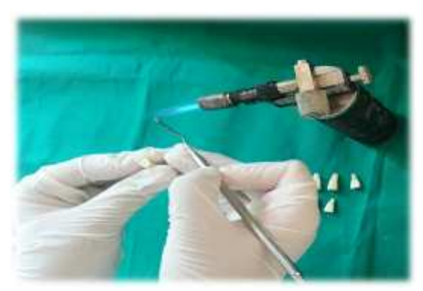
Fig. 4: Removal of coronal 3mm of gutta percha with heated plugger

with the aid of heated plugger ( Fig.4 ) and verified with the help of william's periodontal probe( Fig.3 ). Obturated specimens were divided with respect to the intra- orifice barrier material placed over the root canal fillings into the following groups: