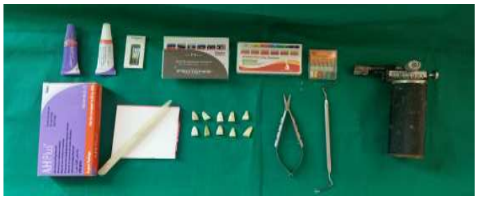
Fig. 2: Armamentarium for instrumentation and obturation of root canals

After determination of the working length, root canals were instrumented with hand ProTaper universal system (Dentsply Maillefer, Ballaigues, Switzerland) in a sequential