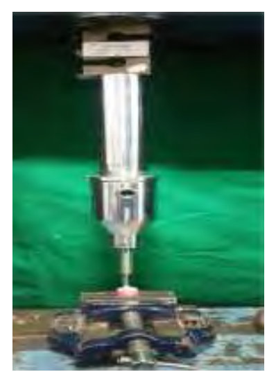
Fig. 6: Specimen mounted in universal testing machine for fracture resistance test

The specimens were mounted on a universal testing machine (Star Testing System, India, Model No. STS 248) and a compressive force was applied at a crosshead speed of 1 mm/min until fracture occurred.( Fig.6 ) The force