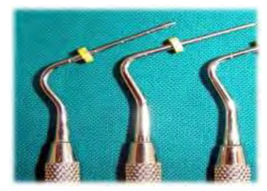
Fig. 3: William's periodontal probe

Except for control group specimens, the coronal 3 mm of root fillings of all other group specimens were removed