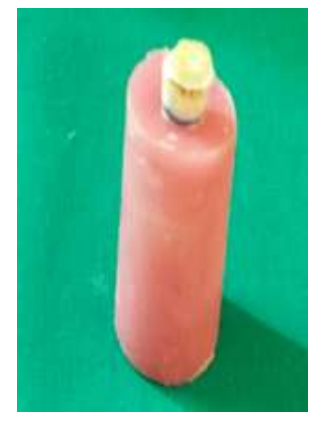
Fig. 5: Specimen embedded in cylindrical acrylic block

The apical root end of each tooth was aligned vertically along their long axis in self-curing acrylic (Quick - Ashvin, Delhi, India) filled in 2cm diameter and 2.5cm height cylindrical polyvinyl tube, leaving 3 mm of each root exposed.( Fig.5 )Periodontal ligament (PDL) simulation