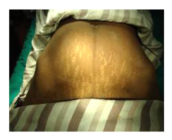
Fig. 2 Showing abdominal lump

She again got admitted after 2 days (on 17th postnatal day) with complaints of pain in abdomen and lump in lower abdomen since 24 hours. Examination revealed marked tenderness in both the iliac fossa. A 12 x 5 cm cystic mass felt in right iliac fossa. Uterus could not be felt separately from the mass. A similar mass of about 9 x 5 cm cystic in nature felt in left iliac fossa (Fig. 2). On per vaginal examination, there was fullness in pouch of douglas and soft boggy mass was felt in posterior fornix. A provisional diagnosis of ovarian cyst was made.