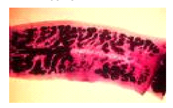
Fig 1: Showing proglottids

and do not elicit inflammation. When the larvae die, they induce a vigorous granulomatous inflammatory response that may produce symptoms depending upon anatomic location. [3] Although most reported cases of cycticercosis involve the brain, this report describes a case of rapid onset lump in abdomen due to Taenia solium during puerperium.