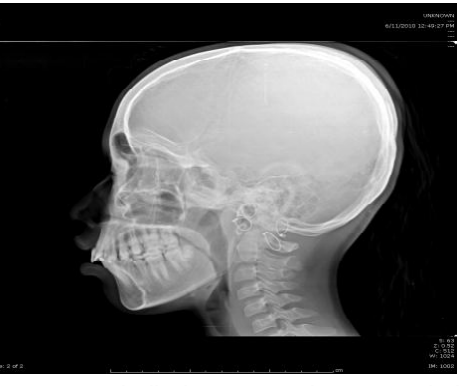
Fig 5: X ray skull showing widening of diploe

xi) Abdominal sonography revealed multiple gall stones, largest stone was 5 mm in diameter (Fig6).