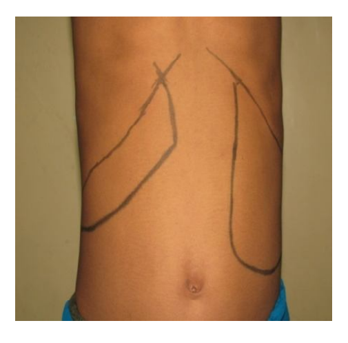
Fig 3: Hepatosplenomegaly

On examination she had severe pallor, deep icterus with lemon yellow tinge (Fig1), mild changes of hemolytic facies (Fig 2). Per abdominal examination showed mild hepatomegaly and moderate splenomegaly (Fig3). Other systems were normal. A provisional diagnosis of chronic hemolytic anemia was made and the case was investigated.