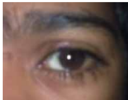
Figure 5: 2 years follow-up : No recurrence of capillary hemangioma.