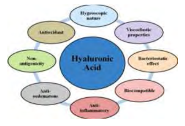
Figure 2: Properties of Hyaluronic Acid