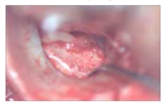
Figure 2: Cartilage in position

the remnant of tympanic membrane. The anterior margin of the cartilage does not extend till anterior annulus but lags 1-2 mm posterior to it. The temporalis fascia graft was kept lateral to the cartilage and medial to tympanic membrane remnant. Handle of Malleus was separated from tympanic membrane and squamous epithelium, and the temporalis fascia was kept lateral to the handle. Anterior tucking of the fascia was also done in addition. No notch was made in the cartilage piece and gel foam was