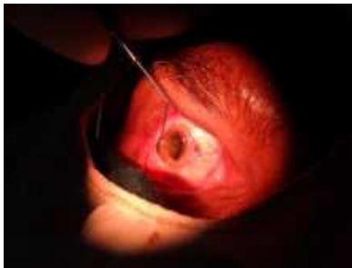
Fig.2 Intraoperative photo showing brown nucleus delivery through CCC.

Preparation of donar corneal button, removal of corneal opacity with trephine, release of iris adhesions at angle and posterior synechiae, CCC, removal of nucleus with vectis and needle cystitome, (Fig. 2) implantation of PMMA rigid one piece PCIOL in bag, 2PBIs, intermittent 16- equidistant- radial 10-0 nylon sutures, AC reformation with air and saline, application of BCL, S/C antibiotic steroid injection and postoperative eye patch bandage was given for 24 hours.